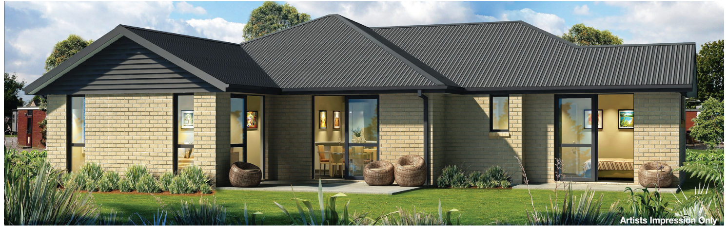
Artists Impression Only